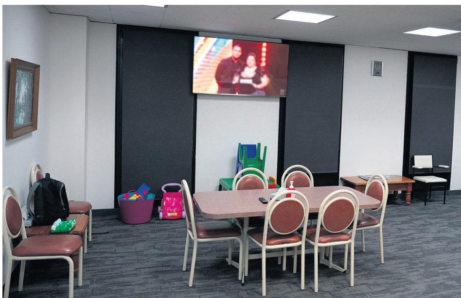
The current Minya Barmah Room.